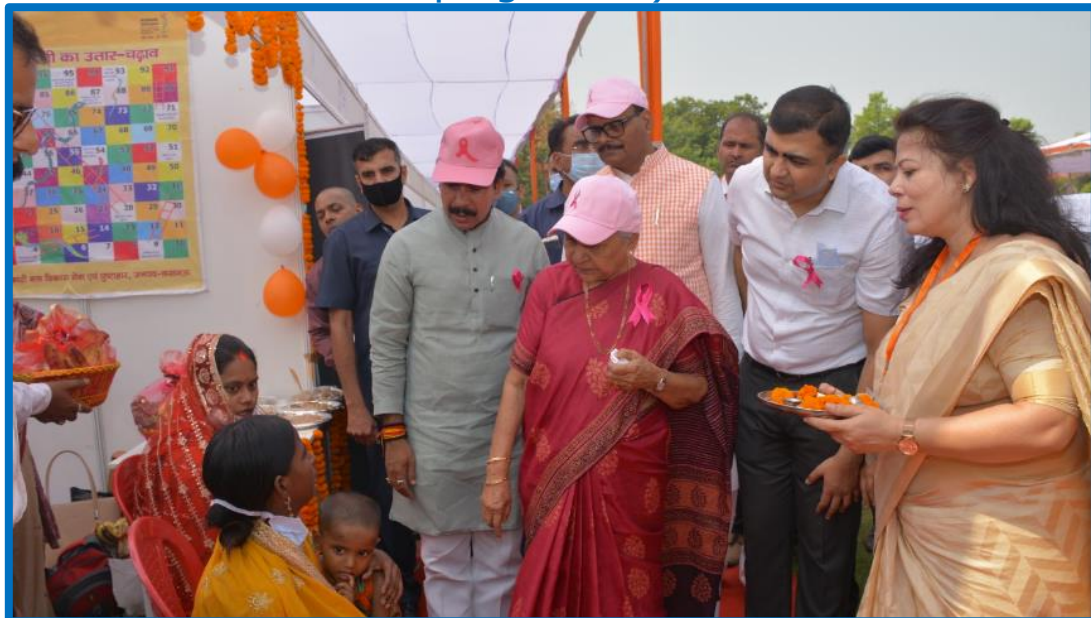
Honourable Governor Madam Smt. Anandiben Patel interacting with patients in the awareness camp