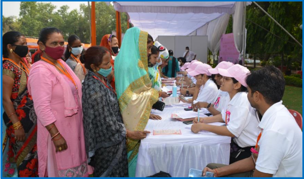
Mohanlal Ganj outreach programme: Participants coming for screening at Breast Cancer Awareness programme at Mohanlal Ganj (outreach programme)